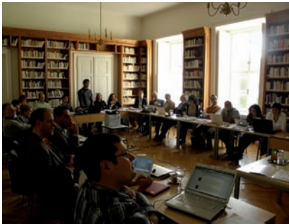
Historiana Training Seminar and Educational Tools Development Workshop, Fehérvárcsurgó (Hungary), 27-30 October 2011

EUROCLIO organised with Yad Vashem, the International School for Holocaust Studies and Research in Israel an International Partnership Development and Training Seminar on Holocaust Education with representatives from 14 countries.