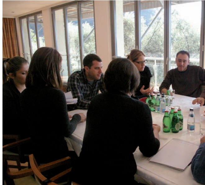
Training Seminar, History that Connects-Former Yugoslavia, Becici (Montenegro), 25-27 November 2011

Mediterranean Dialogues. Promoting Responsible and Innovative History Education in the Middle East and North Africa is a programme enabling educators across the Euro-Mediterranean region to share experiences and stimulates cooperation between North and South. The Mediterranean Dialogues Programme is endorsed within the United Nations Alliance of Civilizations Regional Strategy for the Mediterranean.