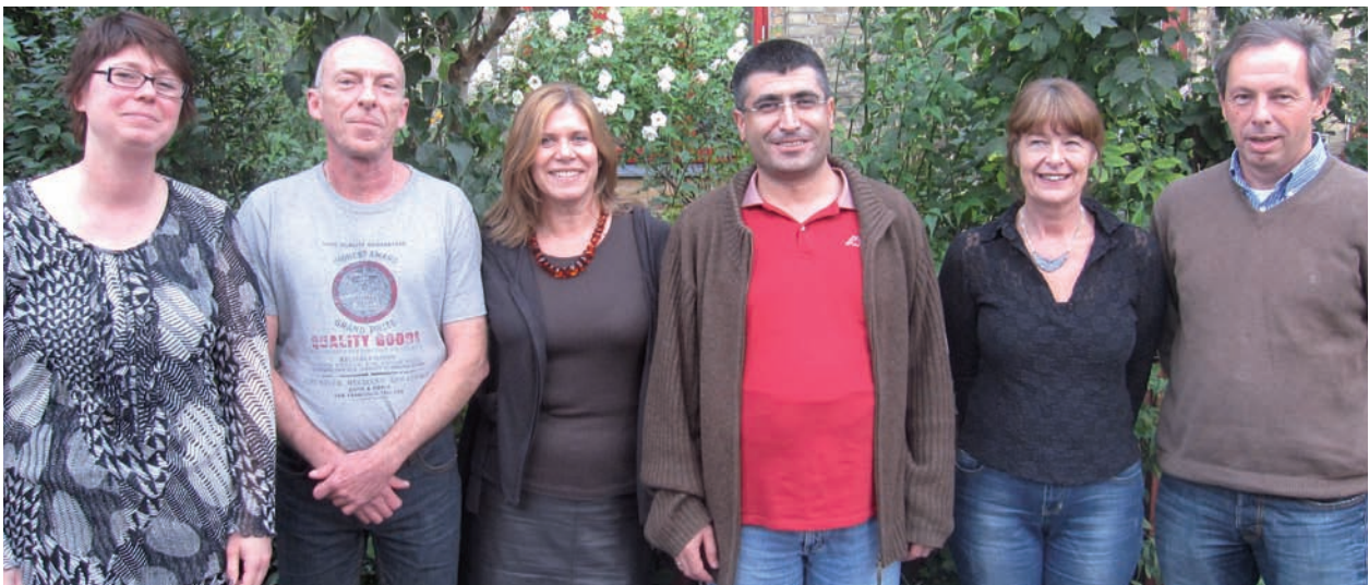
EUROCLIO Board Members in 2011

The Board decided to introduce a system for membership fees which is based on two principles, recognizing the level of economic prosperity in countries and the size of the Member Association, to be put in place over a period of 3 years. The proposal was accepted through an online voting procedure in September.