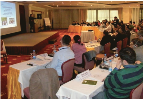
Final Authors and Experts Workshop, A Key to Europe, Innovative Methodology in Turkish School History, Istanbul (Turkey), 20-23 January 2011