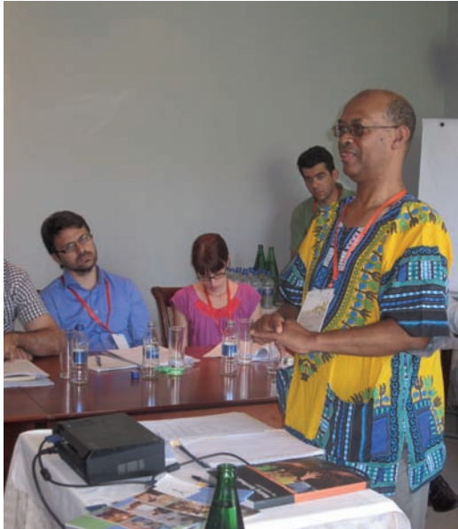
Training Seminar, History that Connects-Former Yugoslavia, Veles (Macedonia), 23-26 June 2011