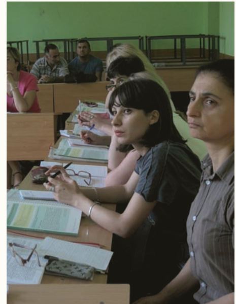
Regional Capacity Building Workshop, Tolerance Building through Education in Georgia, Tbilisi (Georgia), 17 September 2011

In 2011 a National User Conference and 7 regional capacity building seminars were held and a website, www.imsa.ge was launched. The Georgian Association of History Educators (GAHE) grew from 30 members in 2008 to almost 300 and was able to obtain together with EUROCLIO and other partners a new 3 years project.