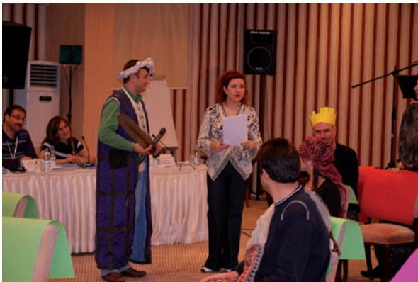
Final Authors and Experts Workshop, A Key to Europe, Innovative Methodology in Turkish School History, Istanbul (Turkey), 20-23 January 2011

Sharing History, Cultural Dialogues, EUROCLIO Transnational Project in Armenia, Azerbaijan, Georgia, Moldova and Ukraine funded by European Union's Eastern Partnership Culture programme (European Neighbourhood Partnership Instrument).