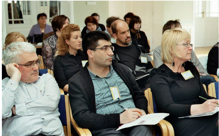
EUROCLIO General Assembly 2011, Krzyżowa (Poland), 9 April 2011

The Annual EUROCLIO General Assembly 2011 was held in Krzyżowa, Poland on 9 April with 13 Member Associations present. The representatives discussed a new membership approach and decided to have an online voting on this issue, in order to allow maximum member input. The Assembly also accepted 2 organizations from Austria and Turkey as new (Associated) Members of the Association.