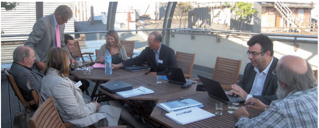
Steering Committee Meeting during the Annual Conference of the European Civil Society Platform on Lifelong Learning (EUCIS-LLL), Krakow (Poland), 9 May 2011