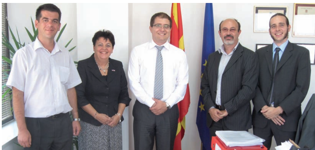
Meeting with the Minister of Education of Republic of Macedonia, Mr. Krlev, Skopje, 19 September 2011