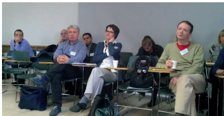
International Partnership Development and Training Seminar on Holocaust Education, Jerusalem (Israel), 15-18 December 2011

EUROCLIO organised with Yad Vashem, the International School for Holocaust Studies and Research in Israel an International Partnership Development and Training Seminar on Holocaust Education with representatives from 14 countries.