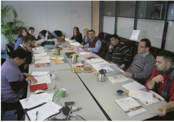
The 1st Editors Meeting, A Key to Europe, Innovative Methodology in Turkish School History, The Hague (The Netherlands), 9-14 March 2011