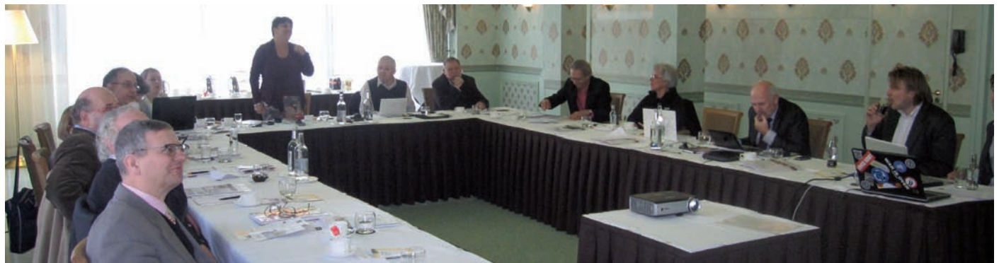
Historiana Advisory Group, The Hague (The Netherlands), 2 December 2011

The international education programme Historiana-Your Portal to the Past , develops an online educational tool that offers access to trans-border, comparative approach to history and heritage, as an alternative for a paper history of Europe and beyond. It presents young people (14-22) the opportunity to compare experiences of people, consequences of historical developments, and make connections between histories. In 2011 the concept of this online tool has become concrete, and the first resources are available on line. The programme involves editors, contributors and advisors from 29 countries. The programme Advisory Group, convened in The Hague, The Netherlands, to discuss the developments within the programme. The Advisory Group members were pleased with the progress that was made; the new design and framework of the online working environment were considered to live up to innovative information technology standards and were seen as a good basis for the further development of the project.