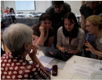
Historiana Training Seminar and Educational Tools Development Workshop, Riga (Latvia), 7-10 July 2011