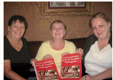
Public Launch and National Training Seminar Tolerance Building through History Education in Georgia, Tbilisi (Georgia), 1-4 September 2011

A key to Europe: Innovative Methodology in Turkish School History funded by MATRA, the Social Transformation Programme of The Netherlands Ministry of Foreign Affairs. The project aims to sustain the ongoing Turkish reform process in history and social studies education by supporting Turkish teacher trainers and school educators. In 2011 the project concentrated on a last Educational Tools Development Workshop and Training Seminar in Istanbul, innovative editing of the educational tool and reaching out to a wider national network of administrators and decision makers. The project looked into implementation strategies also using the newly created Turkish Formator network of in-service trainers and the EUROCLIO Annual Training Symposium in Antalya. The project is endorsed by the Turkey Ministry of Education's Board of Education.