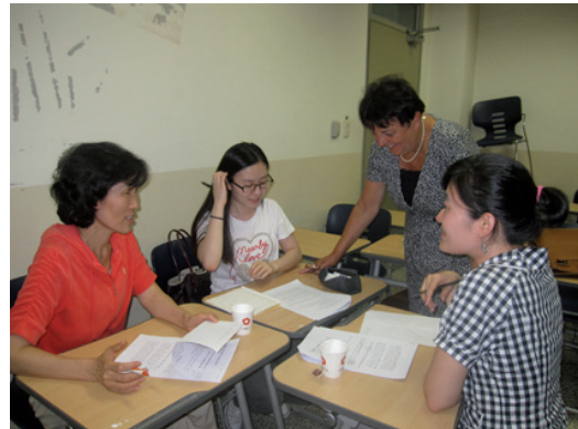
Charing Lectures, Lectures and a Workshop at NGO'S History Forum for Peace in East Asia, Seoul (South Korea), 20-22 August 2011

The EUROCLIO Board, Ambassadors and Secretariat participated in 10 international events related to the learning and teaching of history, heritage and citizenship education in 7 countries, also beyond Europe.