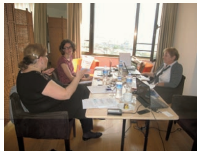
Final Project Management Meeting, Tolerance Building through History Education in Georgia, Istanbul(Turkey), 13-14 October 2011