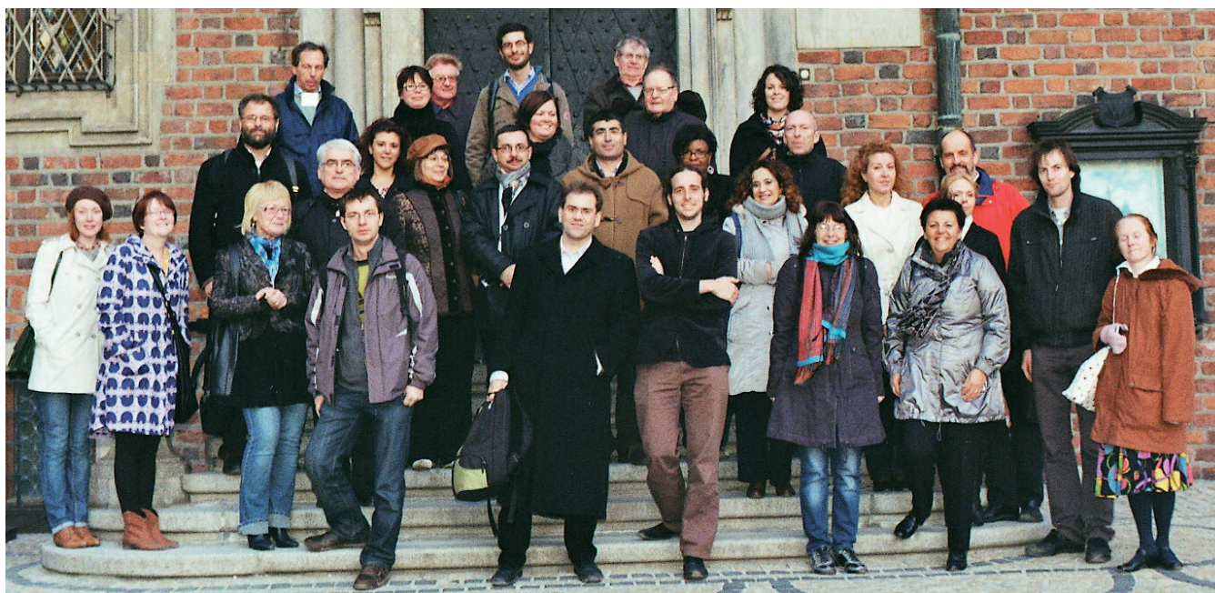
The 18th Annual International Training Symposium Cross Border History: On-site Learning at the Heart of Europe, Krzyżowa (Poland), 8-10 April 2011