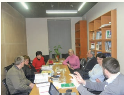
Management Meeting, Tolerance Building through Education in Georgia, Tbilisi (Georgia), 13-15 April 2011