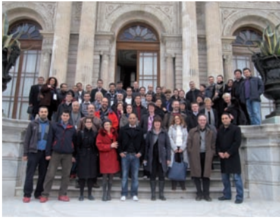
Historiana Training Seminar and Educational Tools Development Workshop, Istanbul (Turkey), 20-23 January 2011