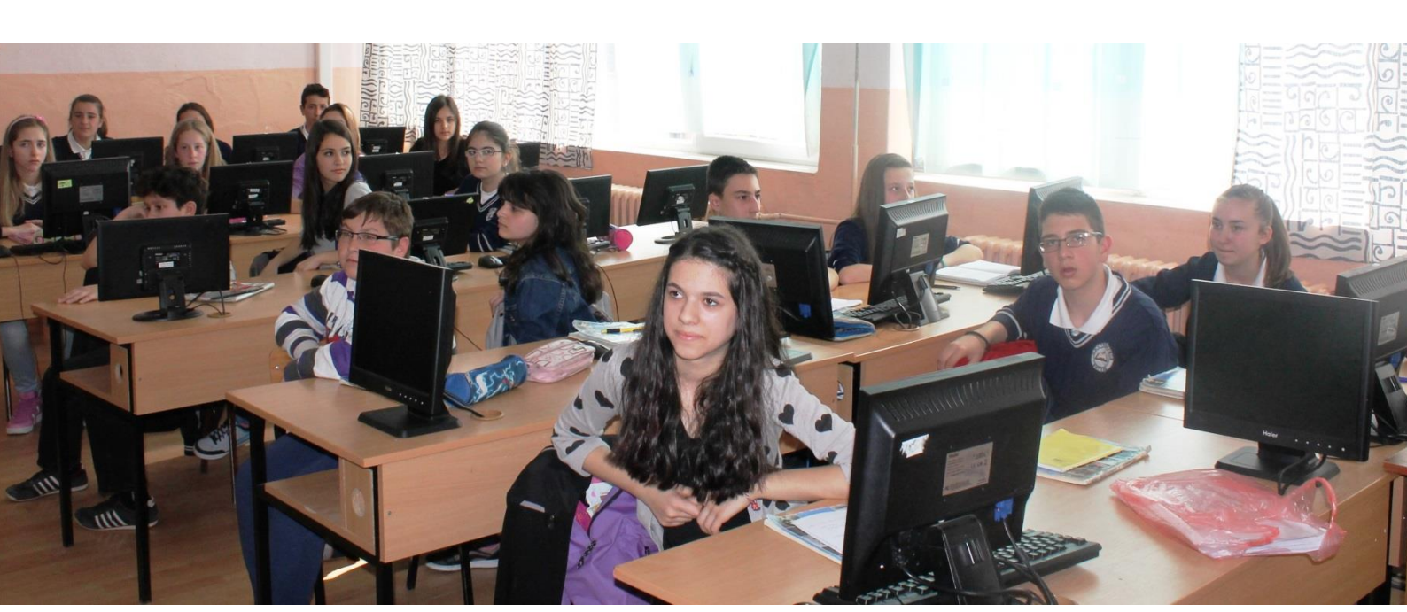
Students at a school in Bitola, Macedonia during an interactive activity, where a school visit was held as part of the EUROCLIO Annual Conference in Ohrid.

See Area of Work 8: Professional Expertise Provider for an overview of EUROCLIO processoriented practical work which has been presented to academic gatherings.