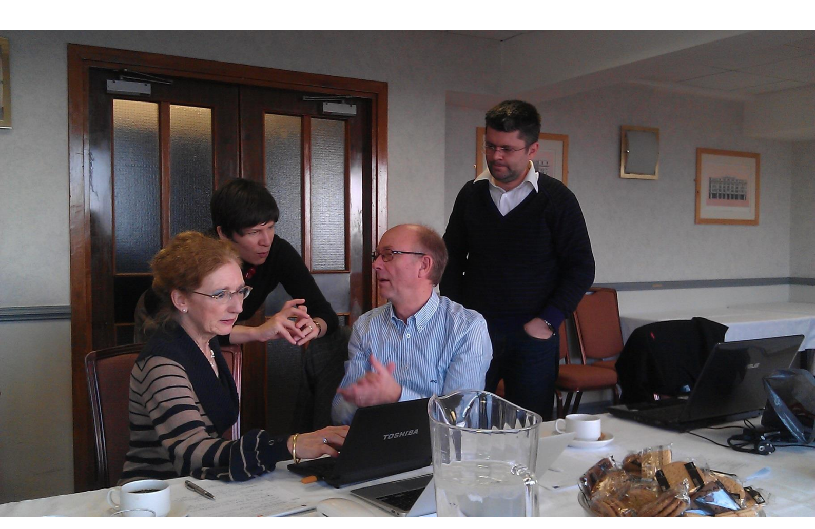
Members of the Historiana teaching and learning team meet in London to discuss the design and interactive features of Historiana to ensure that it is user-friendly.