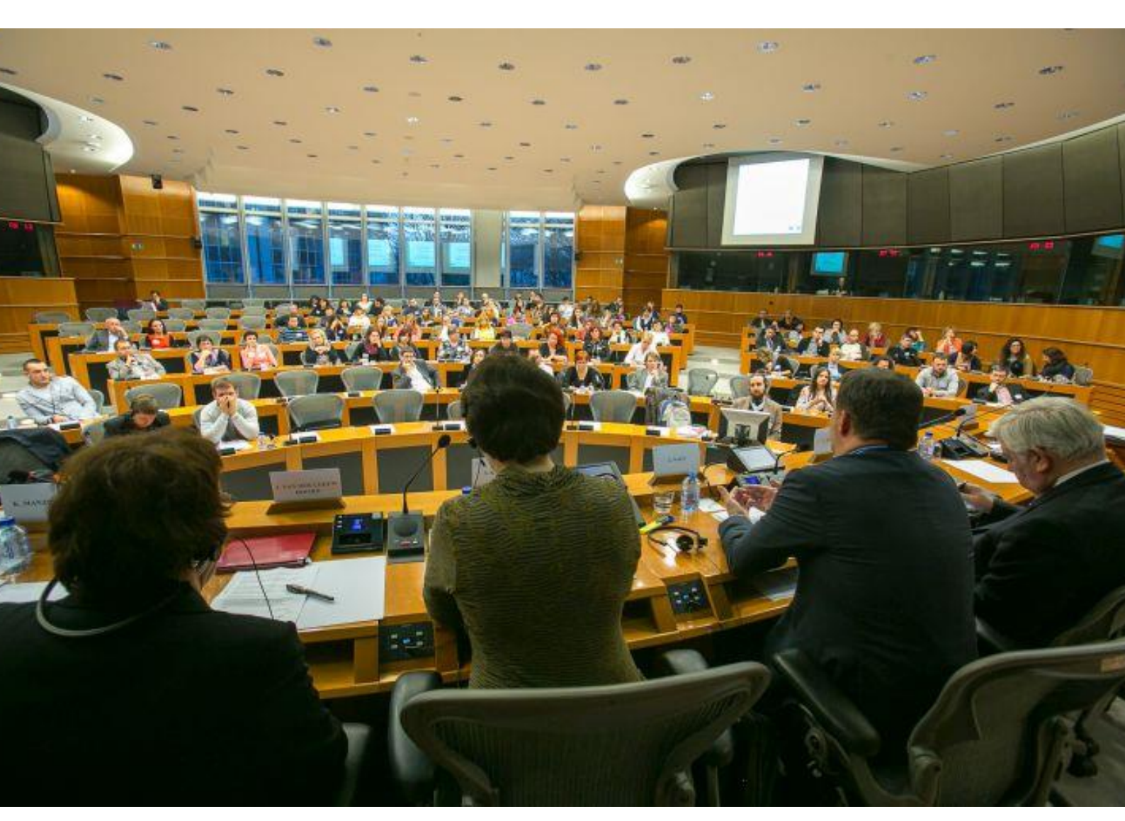
EUROCLIO delegates pictured above in Brussels during one of the aforementioned meetings with European policy makers and educational authorities.

museums, associations, universities and networks. In 2014, 57 of such organisations were involved in face-to-face partnership development meetings with EUROCLIO, many more were engaged with digitally through tele-conferencing.