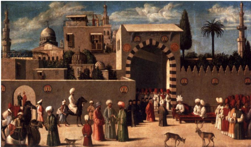
The reception of the Ambassadors in Damascus, circa 1511, a positive example of intercultural contacts in the region.

A history educator from Jordan recognized a lack of recognition within the history curriculum for the diversity which exists in Jordan's society. A history educator from Morocco and researcher in UNESCO Chair of Philosophy for Peace, stressed the need to teach both the positive and the negative part of Moroccan history, because sometimes the current approach is merely focus on wars and the negative parts, leaving out peaceful parts of its history.