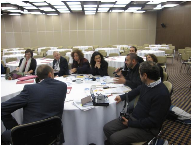
Group discussions during the Seminar

The seminar being held at such a crucial time during the many regional socio-political changes made the event a unique experience. It was the first time that history and citizenship education practitioners from Middle East and North Africa had the opportunity to discuss the challenges and ways forward they saw themselves for the future of history and citizenship education in their respective countries and the wider region. Instead of accusing each other, (an outcome which is often the case when people discuss the challenges of these subjects), the participants demonstrated an open and critical approach to their national systems. This approach made colleagues aware of the common challenges their systems were facing and the role history and citizenship educators have to play as civil society actors facing these challenges.