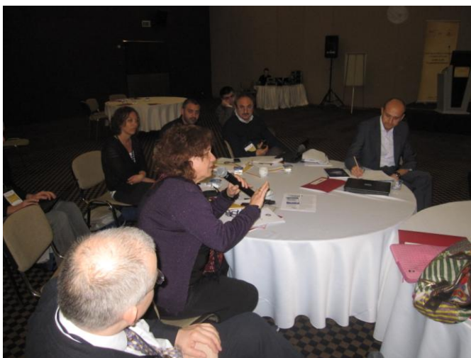
Group discussions during the seminar

Looking at the requirements for innovative history education, the evidence given by the participants certainly demonstrates that still much has to be addressed. In the region there is certainly a need for the implementation of active, innovative and learner-centred methods, which foster independent, critical, self-directed and creative learners. It was positive to notice that people recognized that they were facing many similar challenges, which could and should be addressed together.