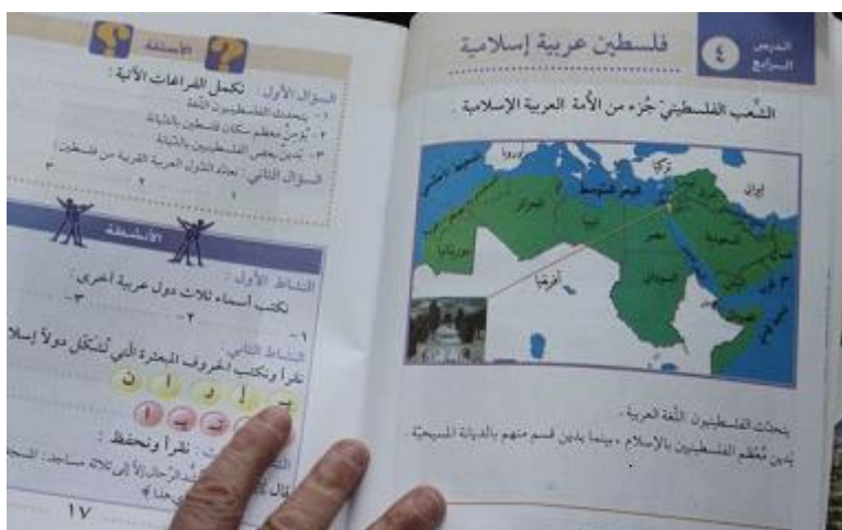
Map of the Arab World in a Palestinian textbook