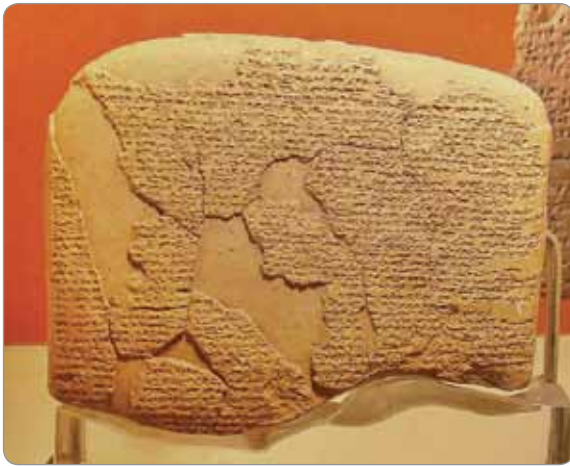
Tablets containing the text of the Treaty of Kadesh

It is concluded that Reamasesa-Mai-amana (Ramesses II) , the Great King, the king of the land of Egypt, with Hattusili, the Great King, the king of the land of Hatti, his brother, for the land of Egypt and the land of Hatti, in order to establish a good peace and a good fraternity forever among them.