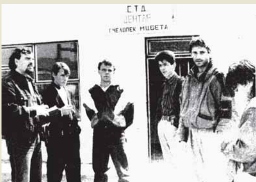
Macedonians and Albanians in front of the village shop