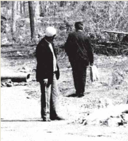
Are the parties choosing our friends?

In Macedonia was created a political climate for separation of the ethnical communities on political grounds. Besides, the voters always opted for the political option that comes from their own ethnical community.